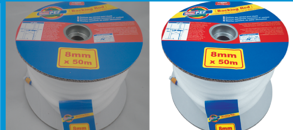
PHOTO EDITING & MANIPULATION

Background removal is a photo editing technique that involves isolating the main subject or object from its original background and placing it on a new or transparent background. This process allows for greater flexibility in using the subject in various contexts and compositions. Background removal is commonly used in e-commerce, product photography, graphic design, and advertising to create clean, professional-looking visuals that focus the viewer's attention solely on the subject. Software tools like Photoshop utilize various selection and masking techniques to accurately separate the subject from the background, ensuring smooth edges and maintaining the fine details of the image.